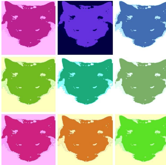
Andy Warhol Artistic Image