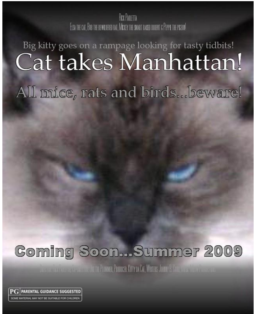
Movie Poster Image