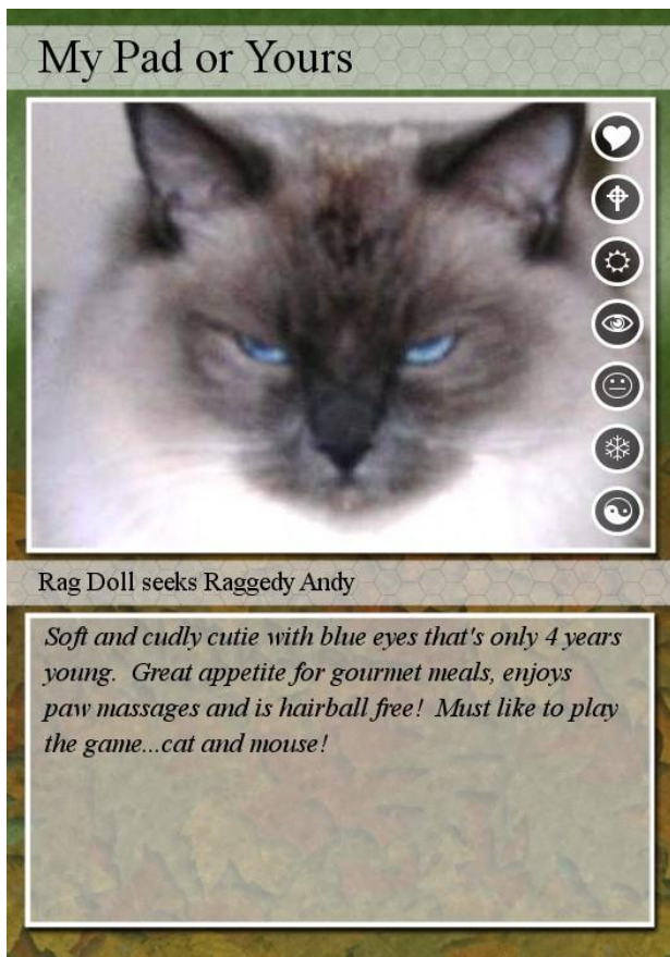
Trading Card Maker Image